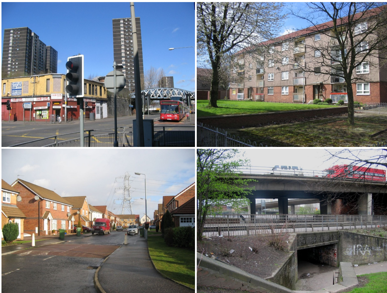
Figure 2 Examples of scenes in and around the local study areas.

calculated the estimated total physical activity energy expenditure for each respondent (MET-min/week) and used a combination of frequency, duration and total energy expenditure to assign each respondent to a 'high', 'moderate' or 'low' category of overall physical activity in accordance with the prescribed IPAQ algorithm. The 'high' category corresponds to a sufficient level of physical activity to meet current public health recommendations for adults [20].